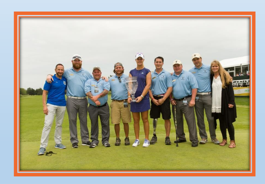
2016 ShopRite LPGA Classic presented by Acer